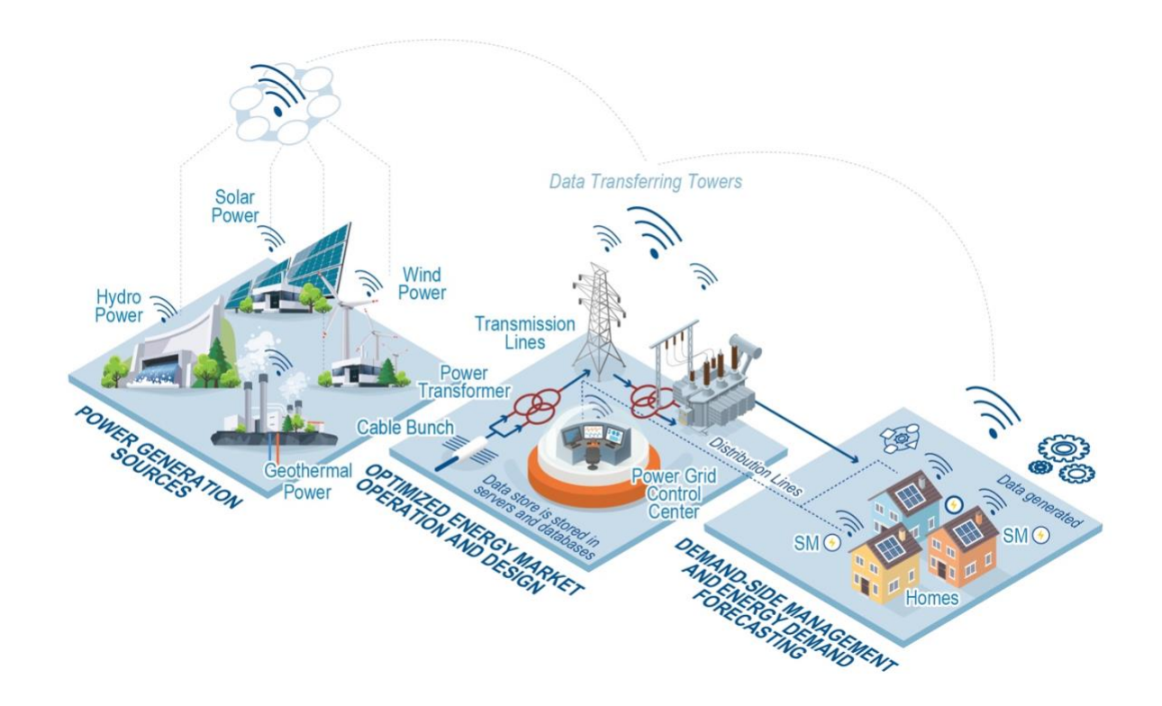
Figure 3-2. Power grid with data transfer